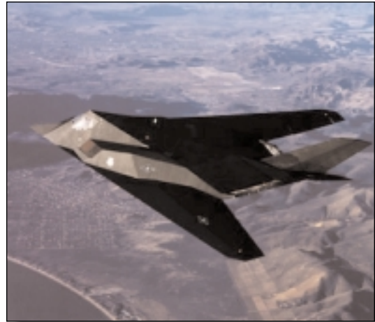
Lockheed F-117 Stealth Fighter.